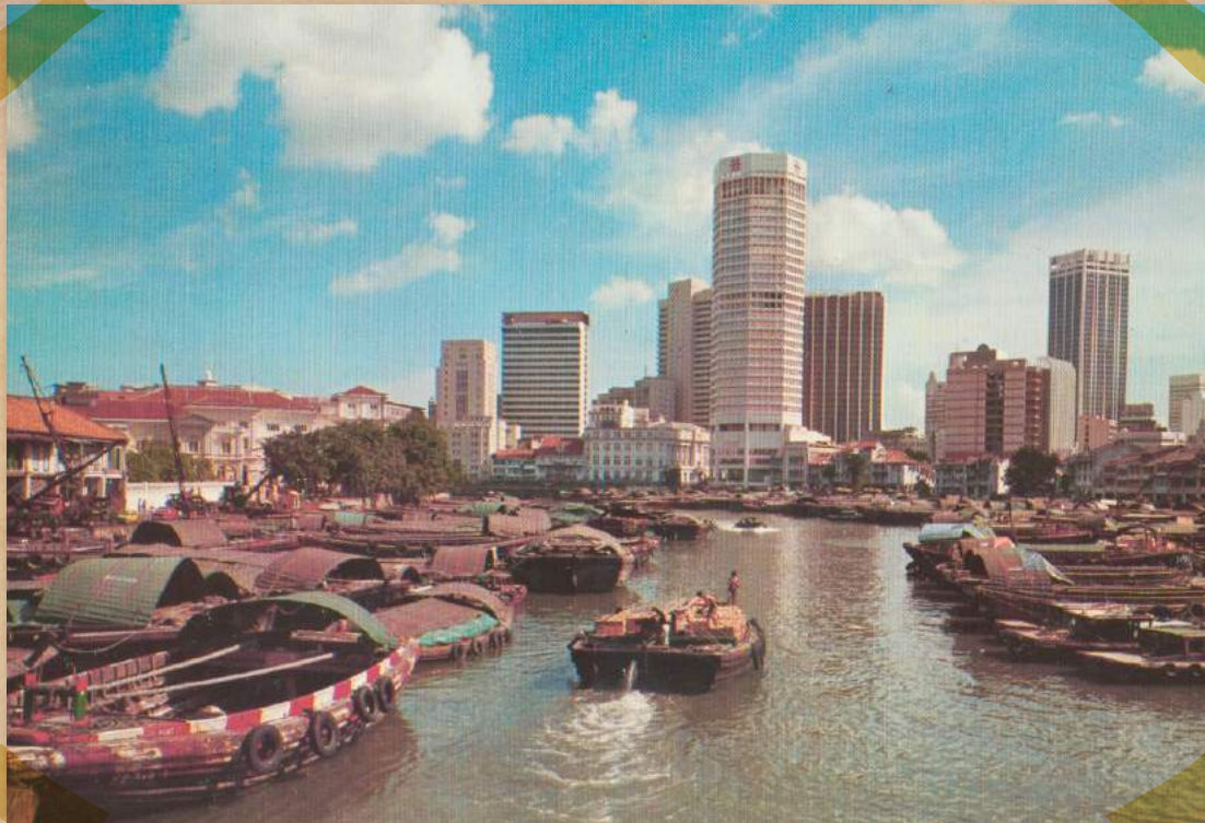
"Twakow" Lighter Vessels on the Singapore River, c.1974