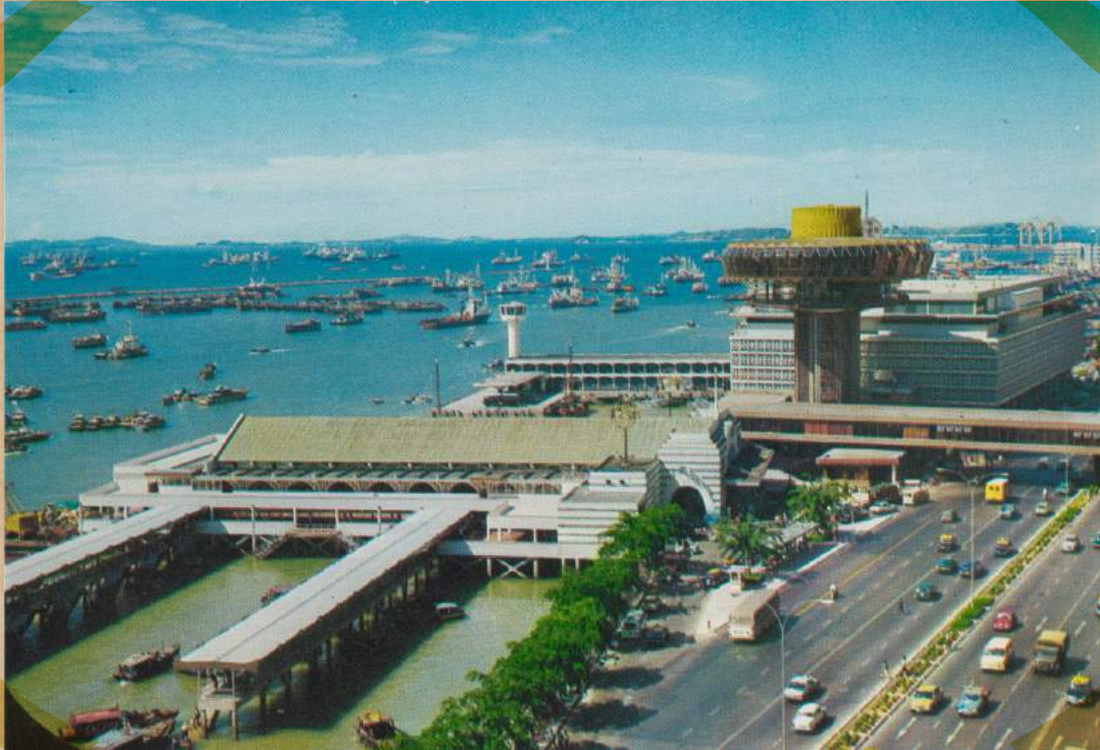
Clifford Pier and Change Alley, c.1970s