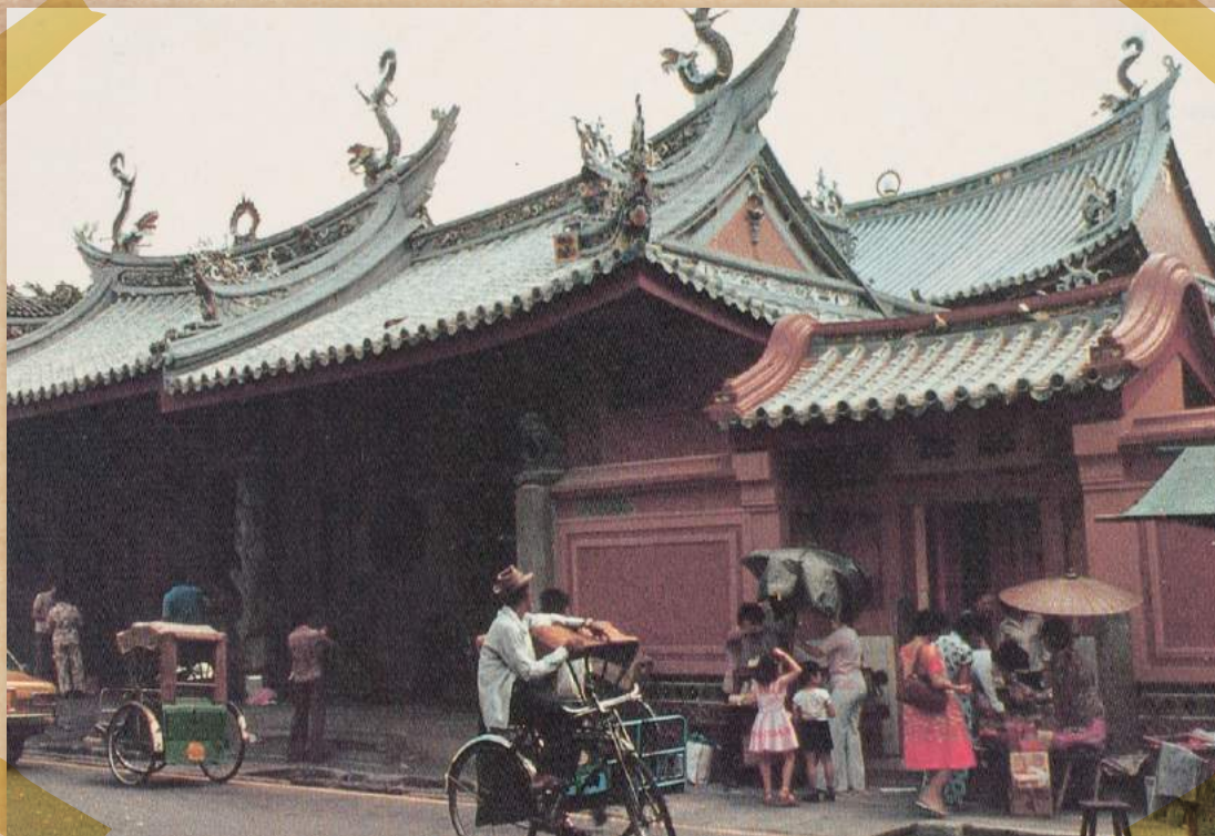
Tian Hock Keng Temple, 1960-1990