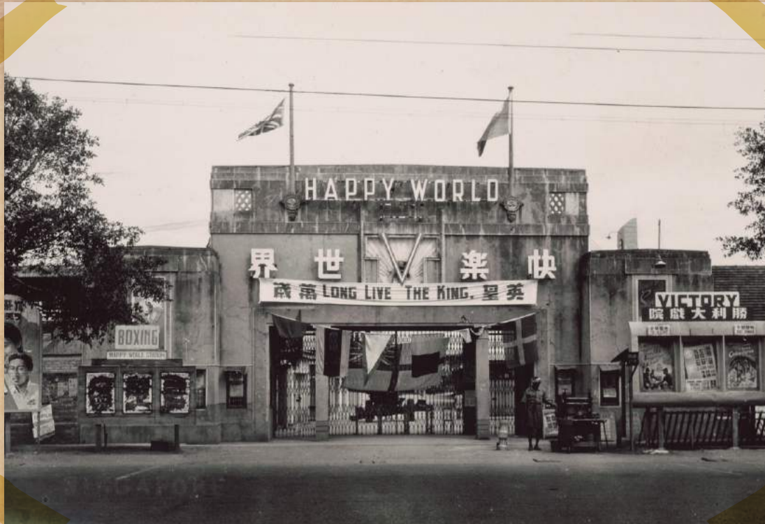
Happy World Amusement Park, 1959