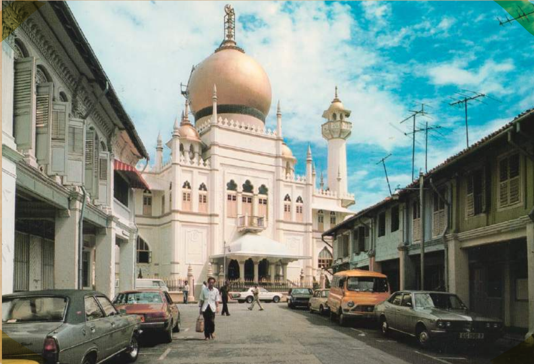
Sultan Mosque on Muscat Street, c.1970