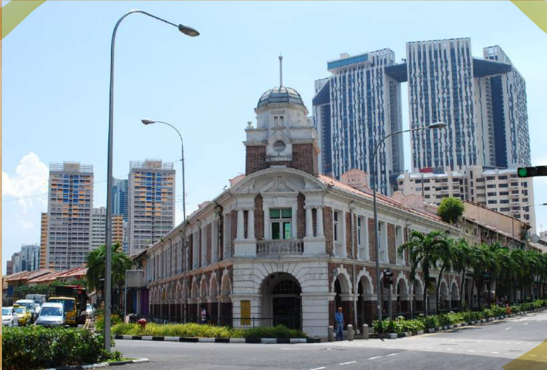
Jinrikisha Station (near Chinatown)