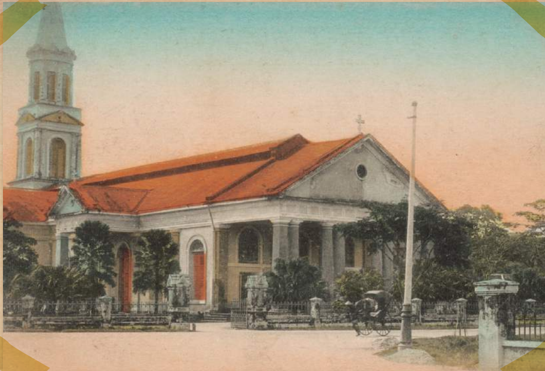
Cathedral of the Good Shepherd, 1890-1920