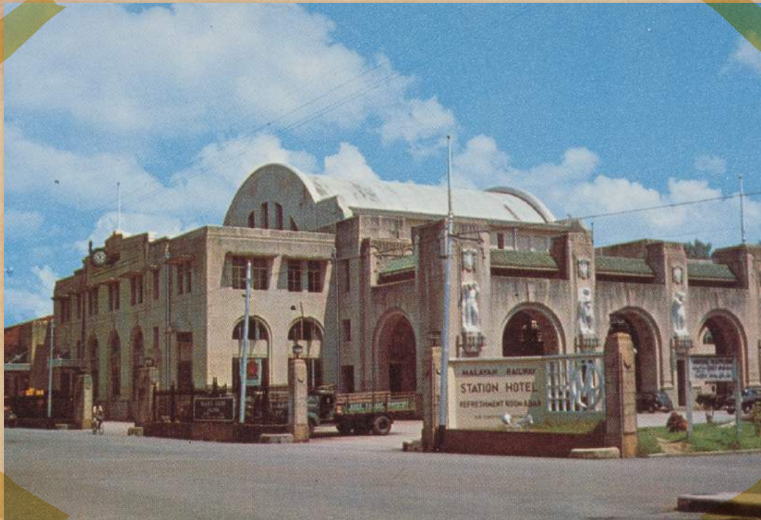
Tanjong Pagar Railway Station, early mid-20th century