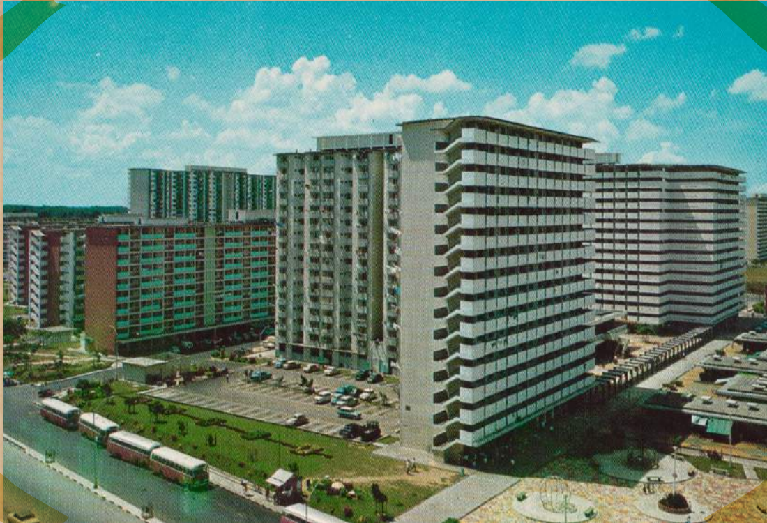
The Toa Payoh New Town Public Housing Estate, c.1960s