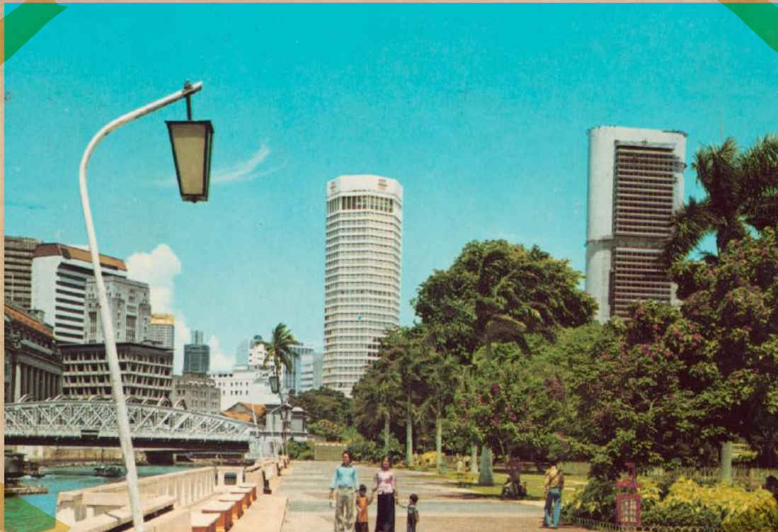
Queen Elizabeth Walk at the Esplanade, mid-1970s