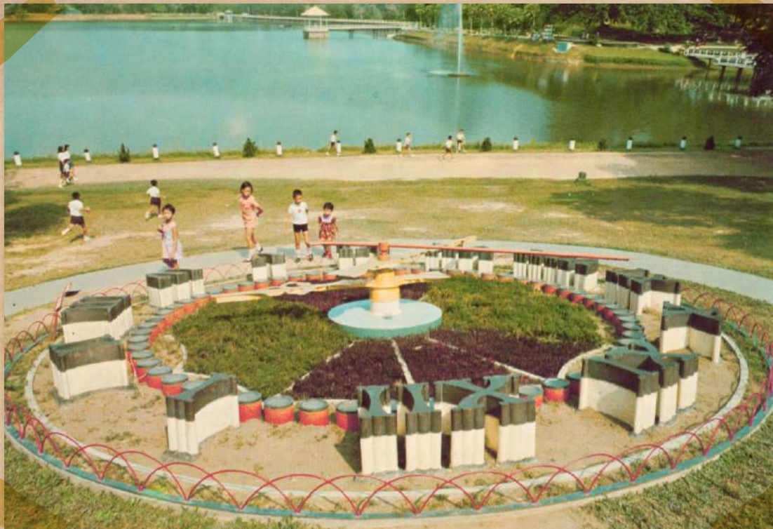
MacRitchie Reservoir, c.1970s