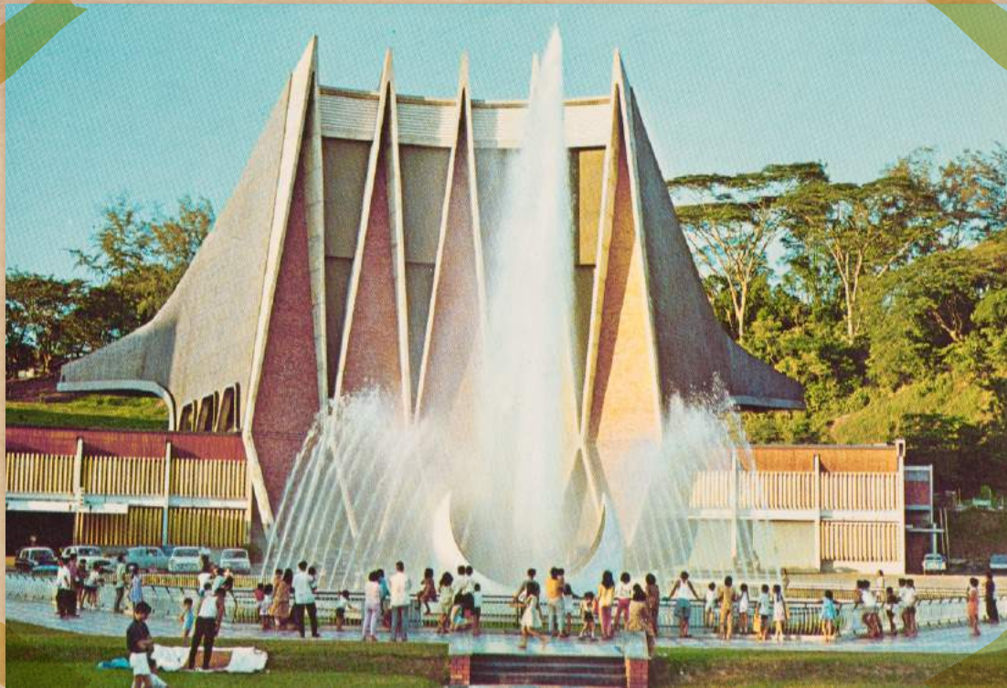
The National Theatre, c.1970