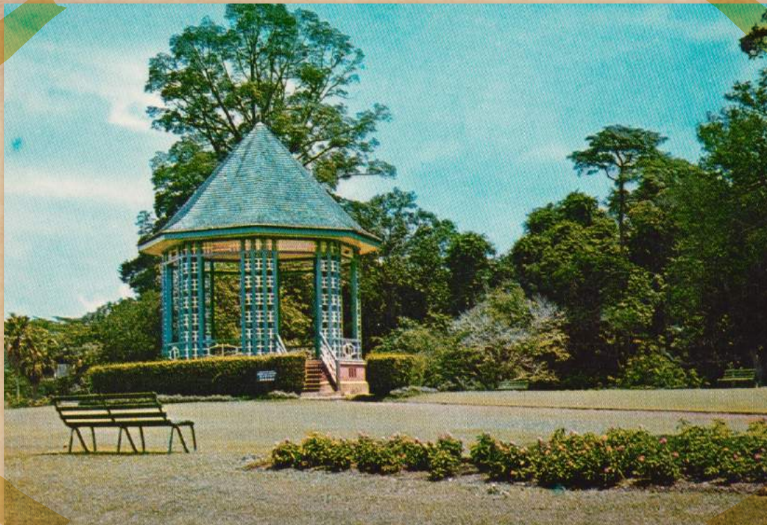
Gazebo at the Singapore Botanic Gardens, c.1970