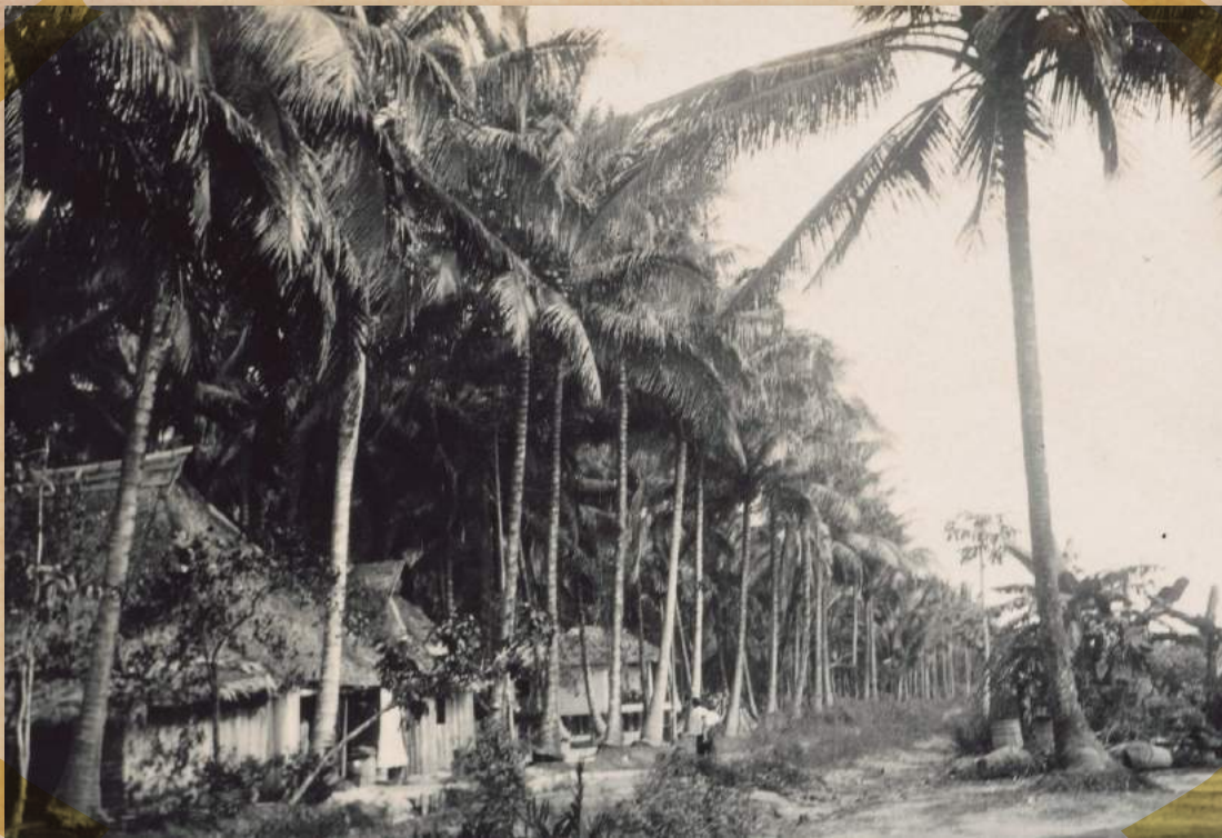
Village in Seletar, 1900s-1930s