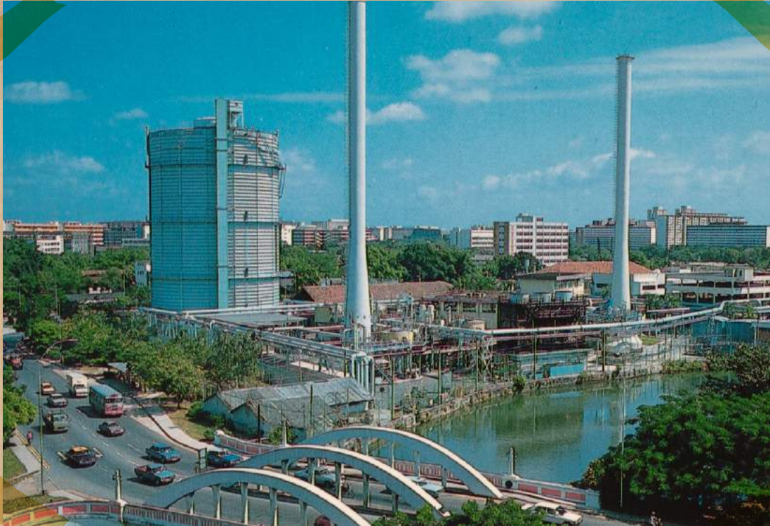
The Public Utility Board's (PUB) Kallang Gasworks, c.1980s