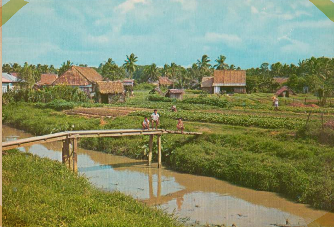
A vegetable farm at Punggol, c.1970s