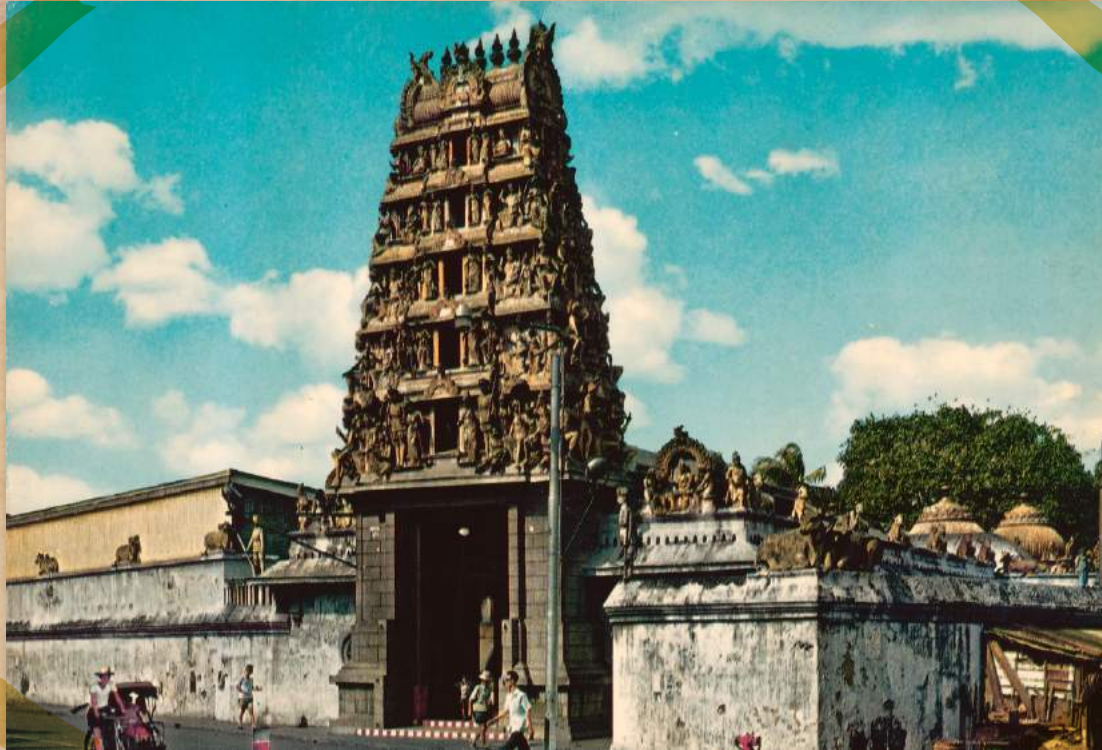
Sri Mariamman Temple, 1960s-1980s