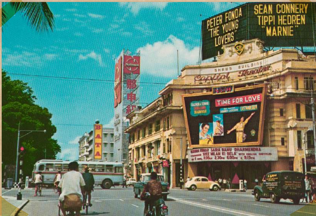
The Capitol Theatre, c.1970