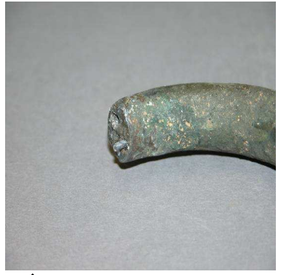
↑A view of the short steel dowel.