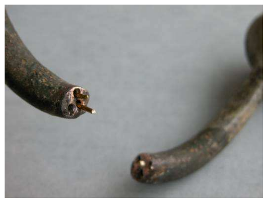
There, the previous dowel holes were re-used. Brass dowels were chosen as brass was less likely to corrode and cause problems in the future. The brass dowels were glued and positioned in place using 'Araldite Rapid' high performance epoxy adhesive.