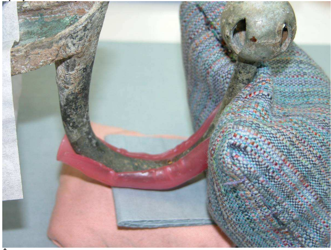
Above, the detached arched shaft was attached together with 'Araldite Rapid' high performance epoxy adhesive and supported by the modeling wax. The equal balance in size and width of the two arched shafts was achieved in this way. Sandbags were used to support and hold the attached shafts in position during the drying process.