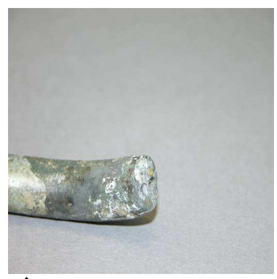
↑ A view of a broken brass dowel.

Once all of the old restoration materials were removed, the edges were cleaned.