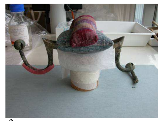
↑ A piece of art modeling wax was used to take the shape of the arch in order to obtain a balance size and shape. This art modeling wax is used for moulding purpose.