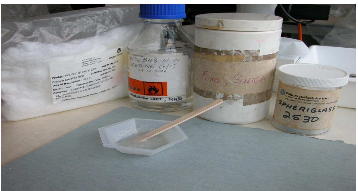
A new filler was used to fill the structural void at the re-attached shaft area. It was made by mixing polyethelene fibers, fume silica, Spheriglass micro-balloons with 30% Paraloid B48 Acrylic resin in Acetone (acrylic adhesive). This filler is a good working material as it would start to dry within minutes, yet soft enough to work a shape out of it by simply adding some acetone to soften it. Within 48 hours, the filler would be concrete hard, thus matching the strength of the bronze Jingle structure.