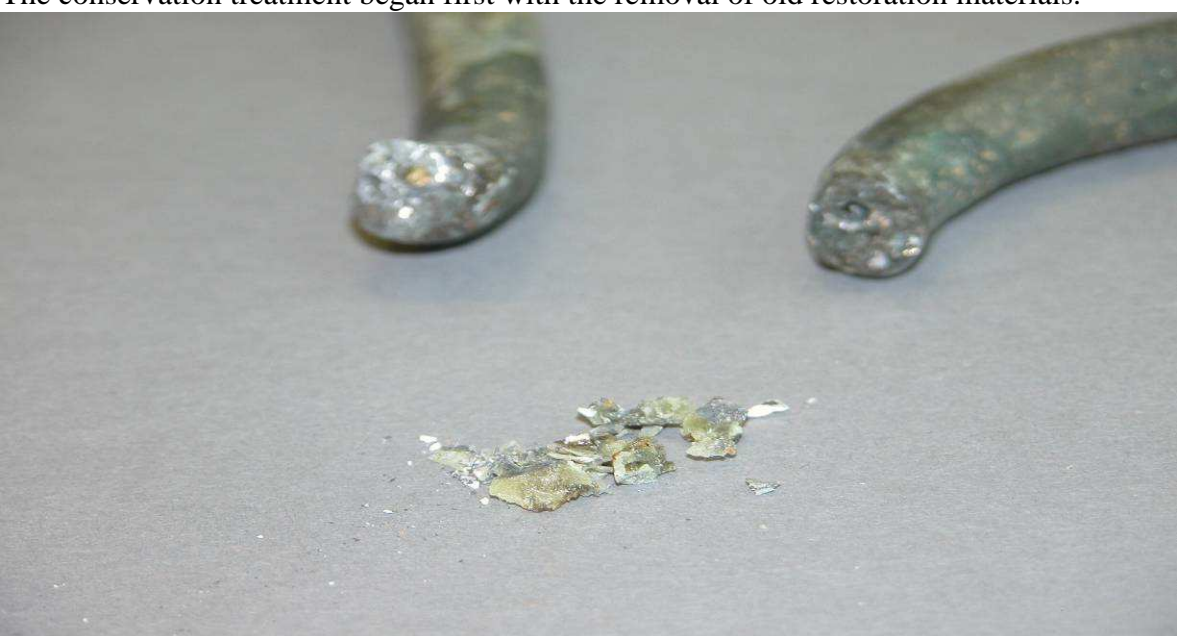
↑View of the old resin and plaster after been removed mechanically using scalpel.

The conservation treatment began first with the removal of old restoration materials.