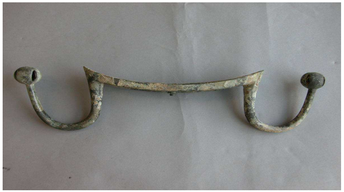
↑ Above is the conserved bronze Jingle. The time taken to conserved the Jingle was 13 hours.