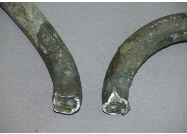
← A closer view of the resin, plaster and dowels.