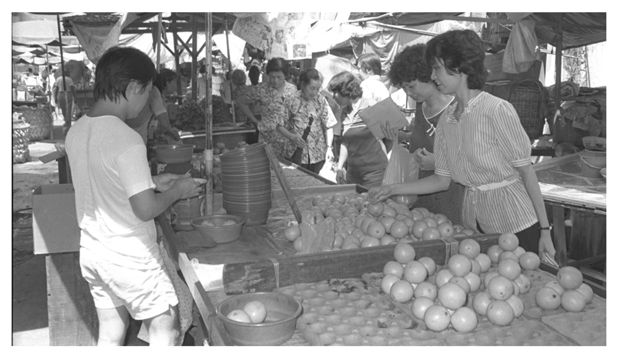
A fruit stall at the Chinatown Market (1983).

Due to the relatively short daytime operating hours of most wet markets (usually between 6am to 2pm), prices of fresh produce can also see variations within the course of a day. By late morning or mid-day, some stall holders will reduce prices so as to cut their losses and maximise sales before they close for the day.