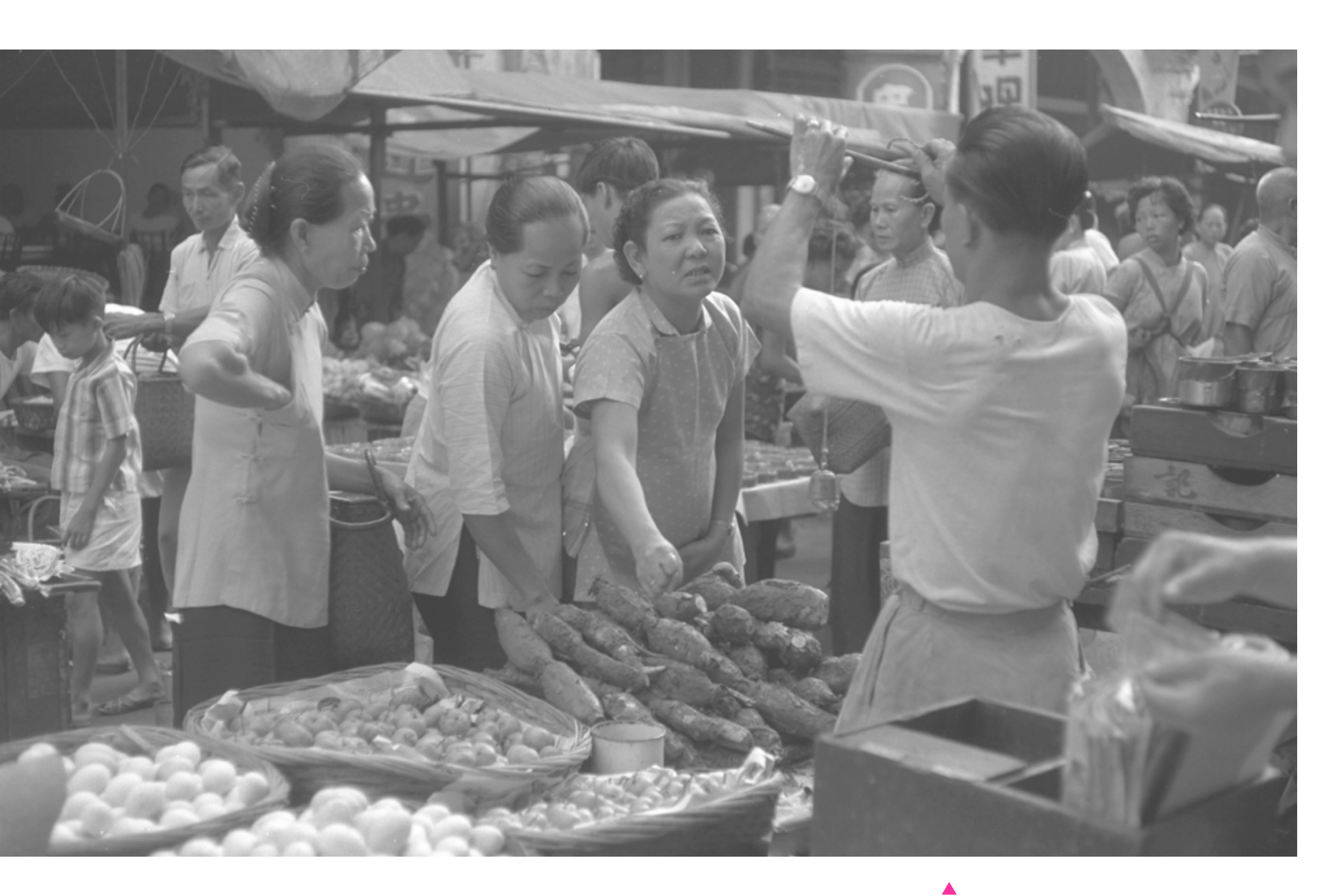
A vegetable stall at Chinatown Market (1962).